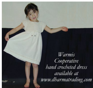
Warmis Cooperative hand crocheted dress available at www.dharmatrading.com