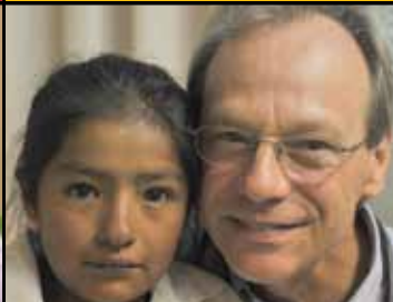
Multi-Specialty Mission Trip